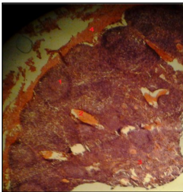
1- Lymphoid follicle, 2- Hemorrhage 3- Medulla, 4-Capsule