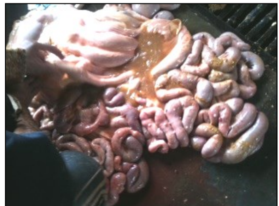
Case n°06: Typhlitis Case n°10: Oesophagostomus